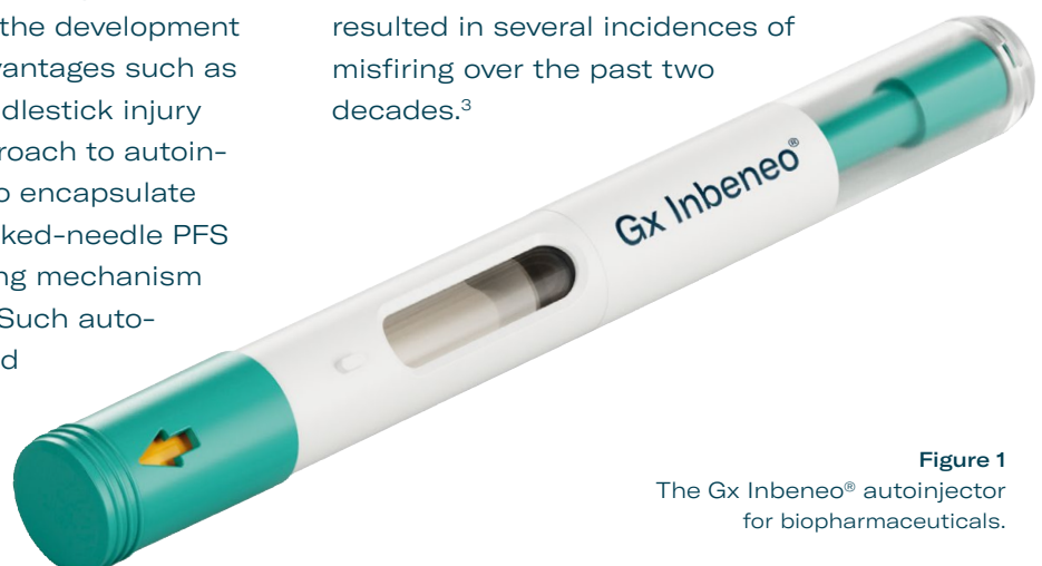
Figure 1 The Gx Inbeneo® autoinjector for biopharmaceuticals.

at the moment of injection. The dual role as “force barrier” and release mechanism is a challenge for many autoinjectors when the spring force is increased to deliver elevated volumes, viscosities or both. This has resulted in several incidences of misfiring over the past two decades. 3