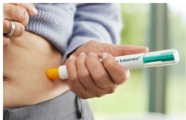
Figure 3 Push-on-skin activation & transparent top casing for progress monitoring

autoinjector is delivered blister-packed, ensuring that it maintains sterility for its entire shelf life and is ready to use as soon as it is needed.