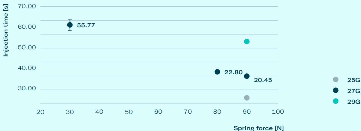
Figure 4 Injection times of 3 mL of 1 cP liquid (water) at three different force levels using the Gx Inbeneo® platform simulator.