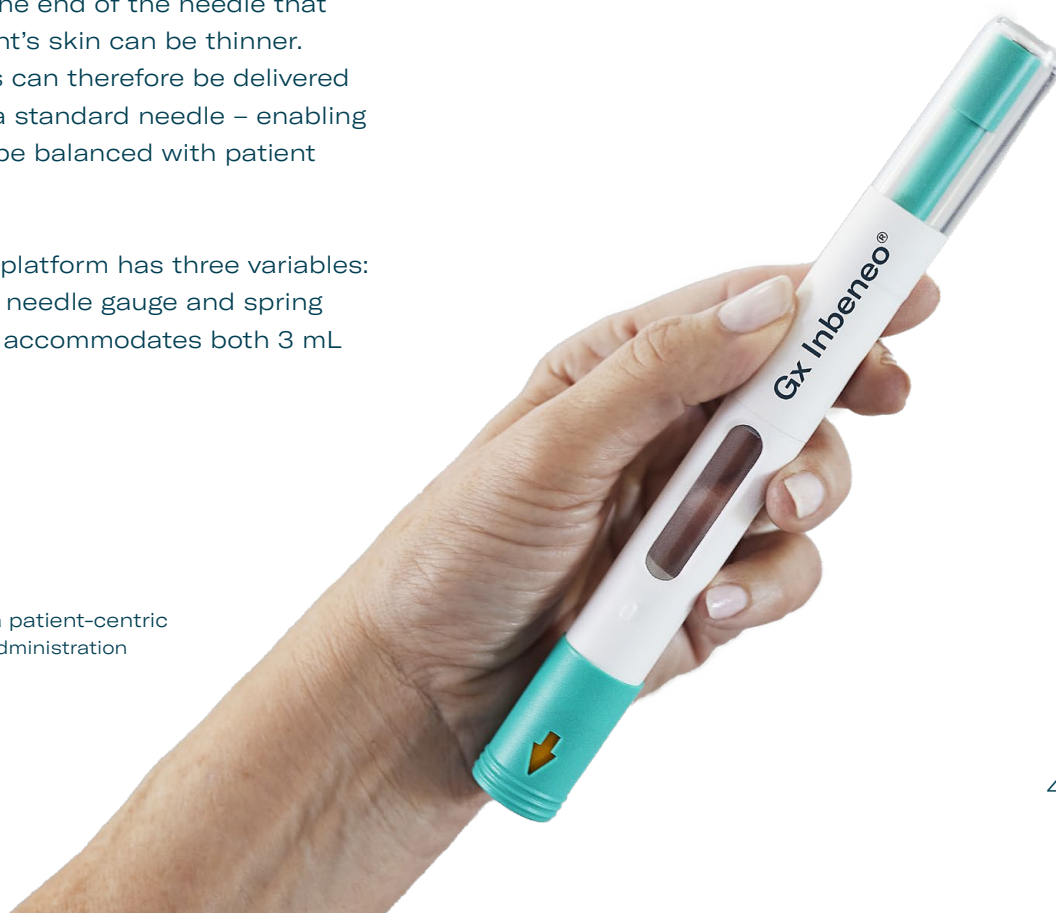
Figure 2 The Gx Inbeneo® is a patient-centric autoinjector for self-administration of biologics.

Once the cartridge is filled with the drug formulation and placed into the simulator, along with chosen needles and springs, it can be manually activated. The needle then pierces the cartridge septum and the formulation is expelled through the needle into a vial. The duration of the simulated injection can be measured and the expelled drug product can be retrieved from the vial for further analysis.